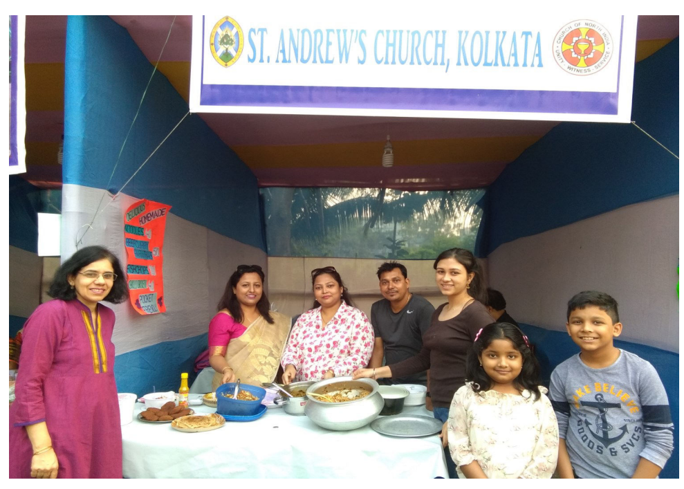
Our stall at the Diocesan Festival this year. Some visitors to our stall ((Below)