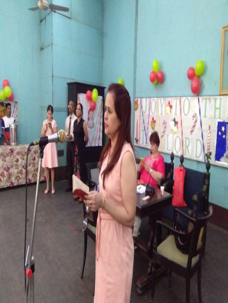
Post- Service Christmas Tree program conducted by Sunday School Teachers with Santa Claus distributing gifts to children along with singing of carols.